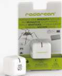
PORTABLE HOME MOSQUITO REPELLER