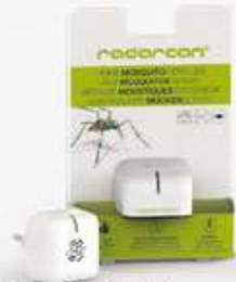
HOME MOSQUITO REPELLER